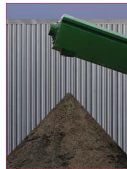
ABOVE: High quality sand recovered.