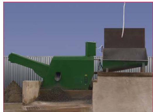
ABOVE: Concrete Reclaimer